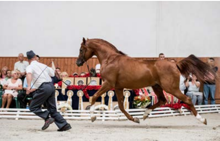
EL OMARI