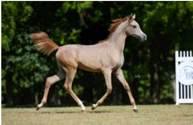
2017 FILLY EMANITIA