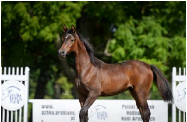
2017 FILLY PERMARINA