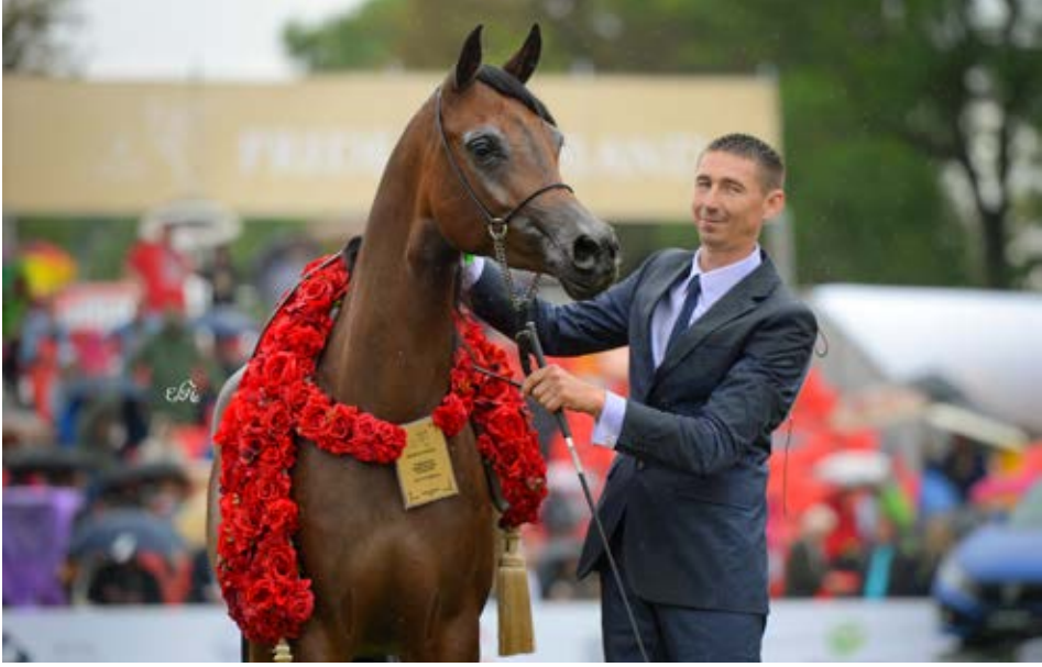
Best Mare Bred in Poland and Best Head PUSTYNIA KAHILA KAHIL AL SHAQAB | PUSTYNNA MALWA O/B: MICHAŁÓW STUD