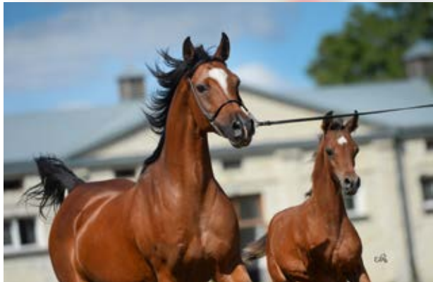
PARILLA WITH 2017 COLT PARILLUS