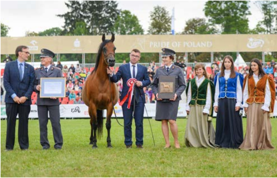
WAHO Challenge Trophy PINGA GAZAL AL SHAQAB | PILAR O/B: JANÓW PODLASKI STUD