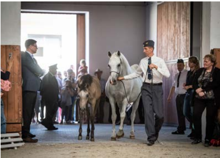
GOLTERIA WITH 2017 FILLY GOLTERIANA