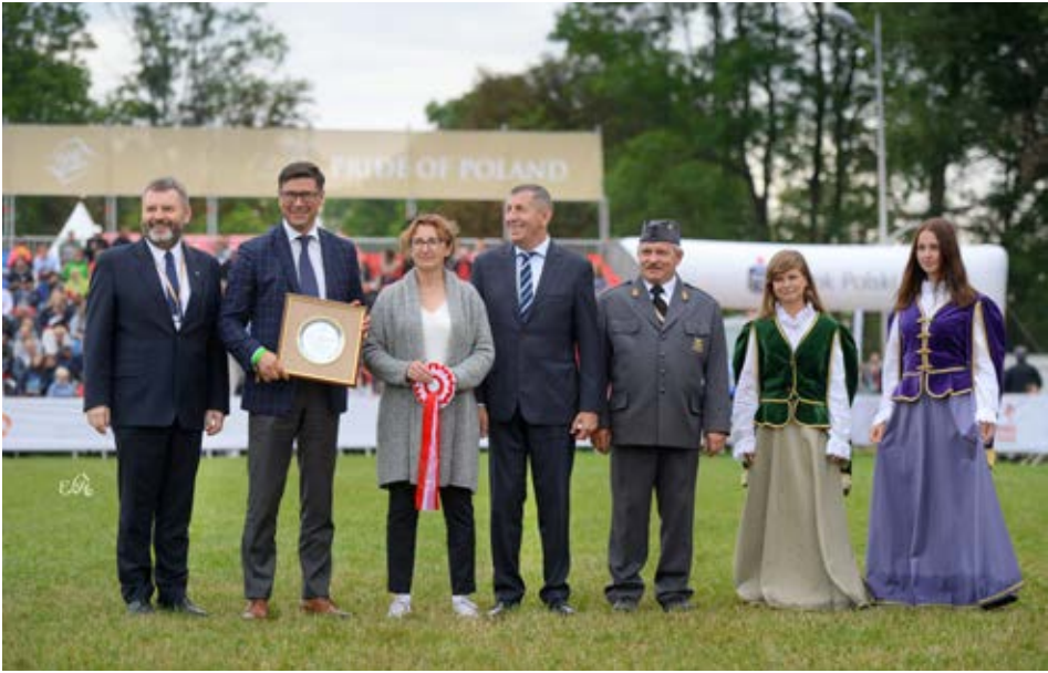
Best Breeder SPONSORED BY: URSUS MICHAŁÓW STUD