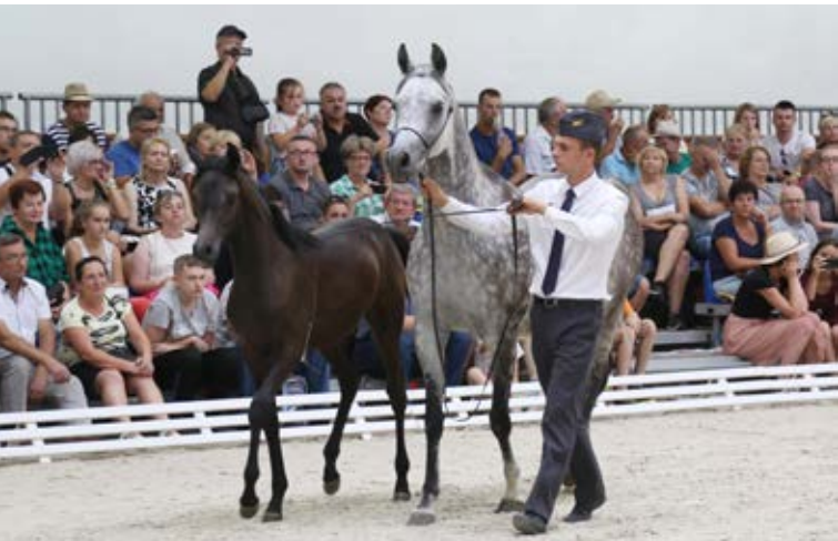
KAROLA WITH 2017 FILLY KALDERA