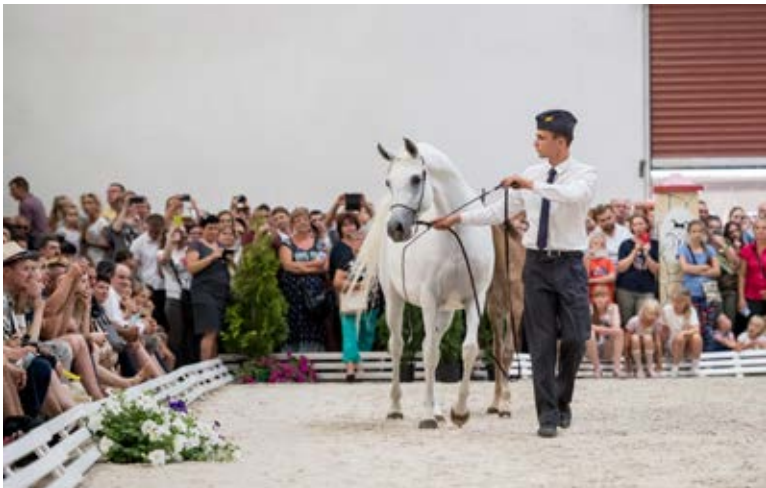
GANDAHARA WITH 2017 FILLY GRANDEZZA