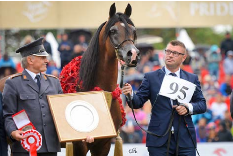
Best in Show SPONSORED BY: ORLEN POGROM QR MARC | PĘTLA O/B: JANÓW PODLASKI STUD